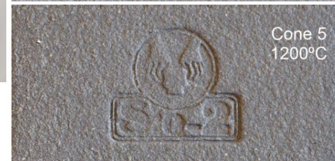
Cone 5 1200°C