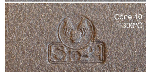
Cone 10 1300°C

Firing range: 1200-1300°C / Cone 5-10 Biscuit temperature: 1000°C / Cone 06 Water content: 17% Plasticity (IP Atterberg): 16 Carbonate content (CaCO 3 ): 0% Drying shrinkage: 5.3% Firing shrinkage 1300°C: 4.3% Porosity (water absorption) at 1300°C: 4.5% Dry bending strength: 2.8 N/mm 2 Fired bending strength (1300°C): 37.8 N/mm 2 Thermal coefficient 1250°C (25-500°C): 61.6x10 -7 °C -1