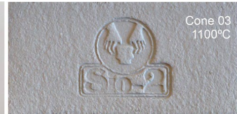
Cone 03 1100°C

When fired at different temperatures, the clay produces a range of greys, from cement to dark grey, which is perfect for meeting the demands of avant-garde trends in artistic and decorative ceramics.